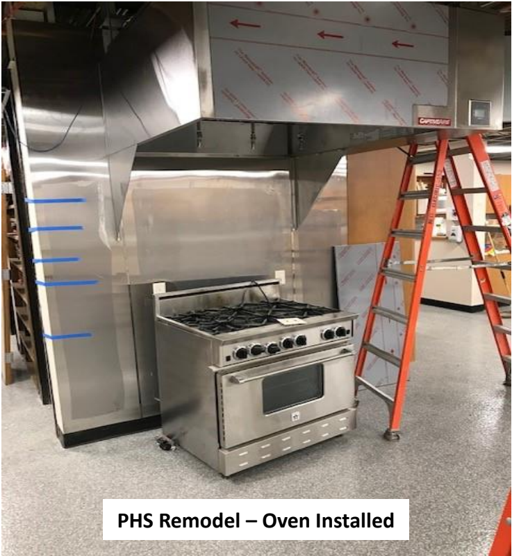
PHS Remodel – Oven Installed