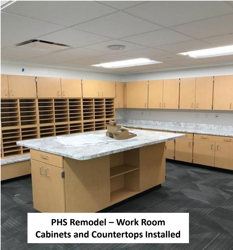
PHS Remodel – Work Room Cabinets and Countertops Installed