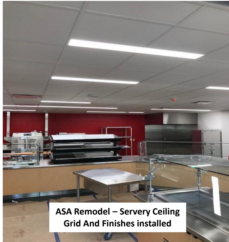
ASA Remodel – Servery Ceiling Grid And Finishes installed