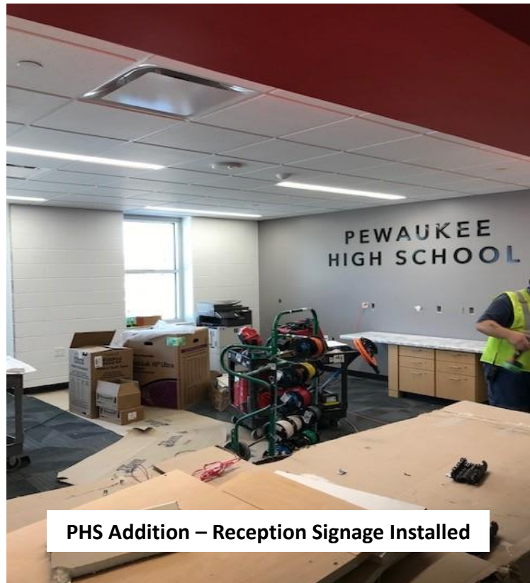
PHS Addition – Reception Signage Installed