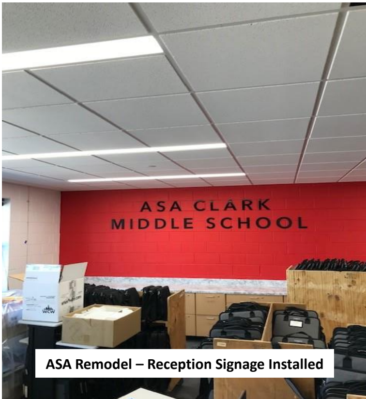
ASA Remodel – Reception Signage Installed