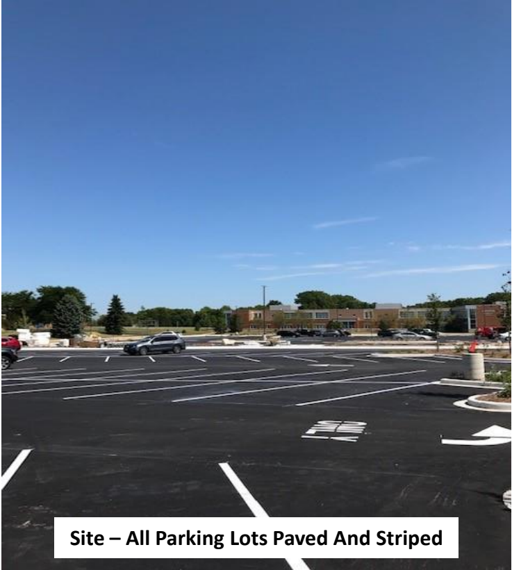
Site – All Parking Lots Paved And Striped