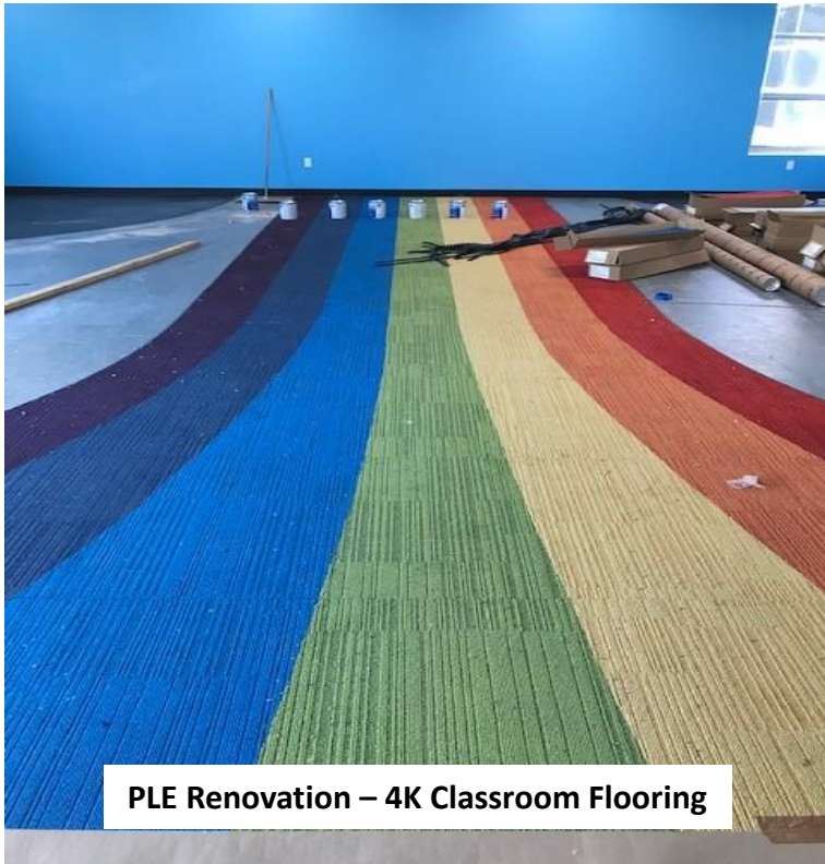
PLE Renovation – 4K Classroom Flooring