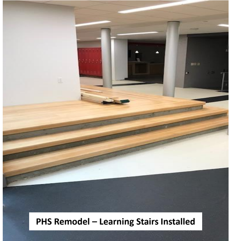
PHS Remodel – Learning Stairs Installed