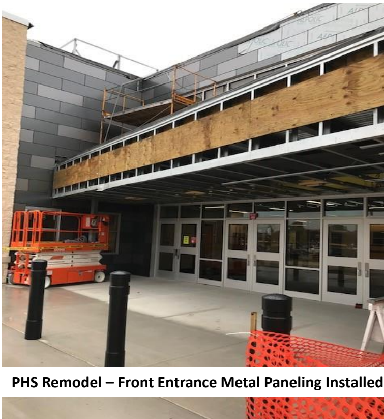
PHS Remodel – Front Entrance Metal Paneling Installed