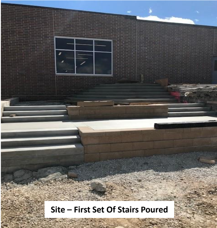
Site – First Set Of Stairs Poured