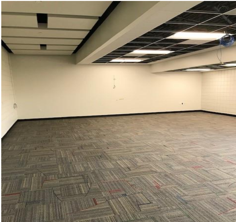
PLE Renovation – Carpet Installed In The Music Room