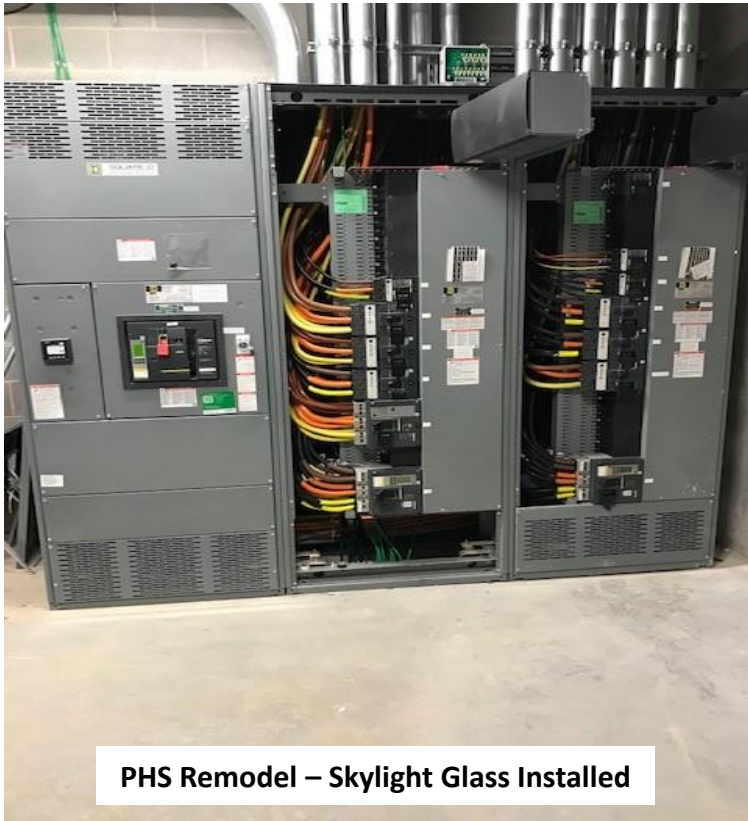
PHS Remodel – Skylight Glass Installed