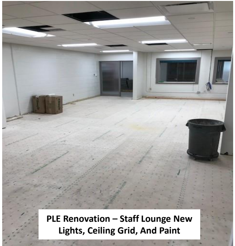
PLE Renovation – Staff Lounge New Lights, Ceiling Grid, And Paint