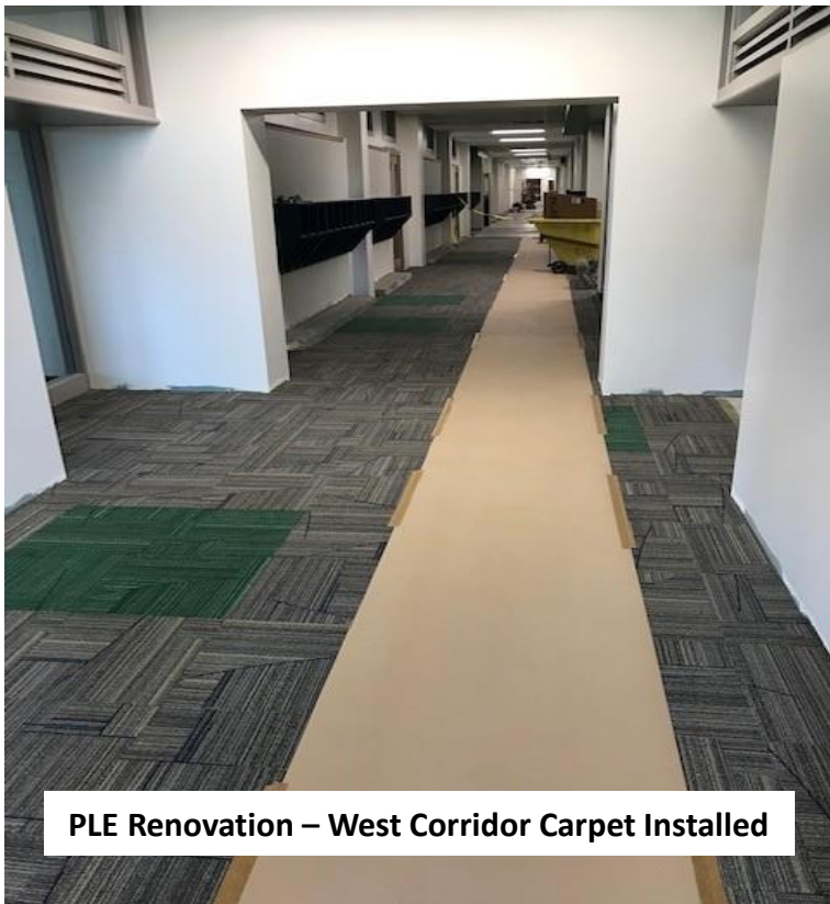
PLE Renovation – West Corridor Carpet Installed