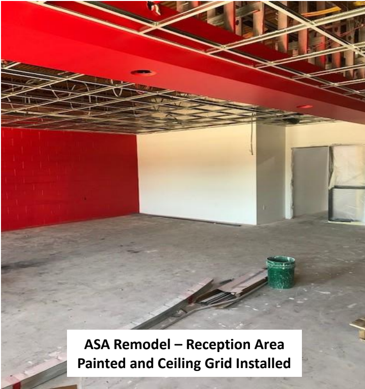
ASA Remodel – Reception Area Painted and Ceiling Grid Installed