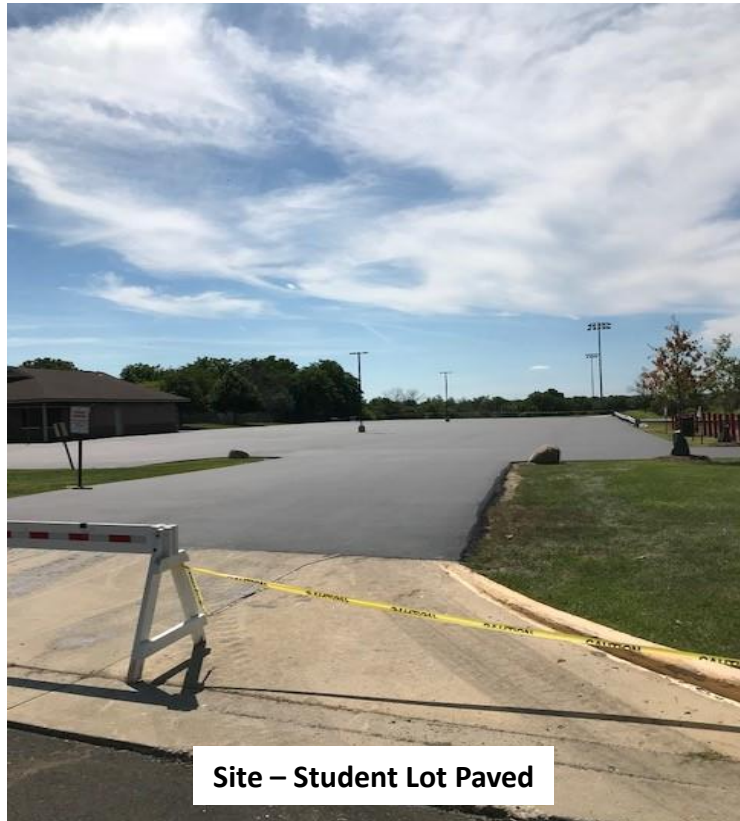
Site – Student Lot Paved